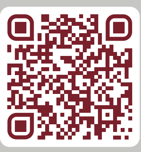
Scan to access online course guide

If you are unable to access the internet from any device, a printed copy of the course information is available from the school upon request.