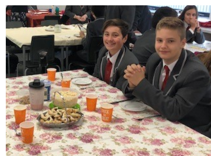
All set for a Beacon breakfast: students pose for a quick pic before tucking into their trick or treat inspired feast.

In a decidedly Halloween-inspired Healthy Breakfast Challenge this week we saw an excellent array of well-balanced and nutritious breakfasts, some really inventive presentation techniques and a great serving of teamwork. An extra well done to the Spooky Scary Skeletons in Beacon who took the title this year, scoring max points in all categories!