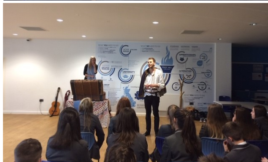
Shakespeare in a suitcase: performers from Splatsentertainment presenting their rendition of Romeo and Juliet