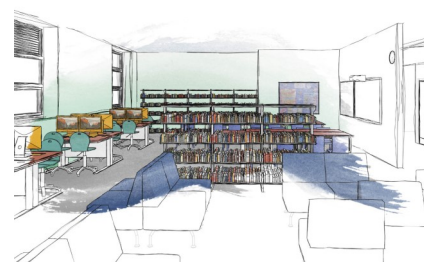
Learning hub: An artist's impression of the open plan library and resource centre that will form part of our new facilities.

With building work underway on the permanent site, planning is now focused on developing the contingency plans for September 2019—April 2020 in collaboration with the ESFA, including the siting of our additional accommodation on the Toot Hill Site.