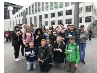
Right: WE Day 2020. Students had to earn their ticket though social action projects.