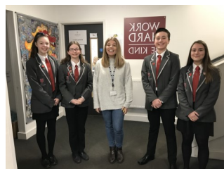
Left: Nov 2019. BBC Radio Nottingham came into school to do a live on air interview re: Ending Period Poverty.