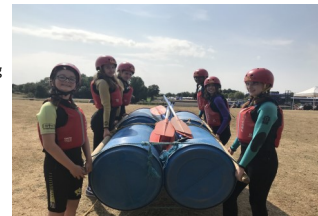
Right: July 2018. Students enjoy a rewards trip to the National Watersports Centre.