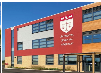
Before and after: a glance back at where it all began in Bingham alongside our amazing new home in Newark