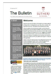
Where it all began: the very first edition of The Bulletin in September 2017 (above).

Welcome to the 100th edition of The Bulletin! To mark the occasion, we thought we would take a look back at where we have come from and share just a few of our most memorable events. Our school has gone from strength to strength since its humble beginnings in 2017; we have grown from just two Year 7 classes to a school of four year groups and an expanding group of dedicated staff. We are so proud of everything our students and staff have achieved so far and we are really excited about the year ahead—with or without Coronavirus, the future is ours for the taking.