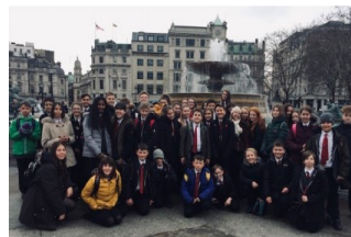
Left: Jan 2019. Trip to London to watch ‘The Curious Incident of the Dog in the Night-Time’