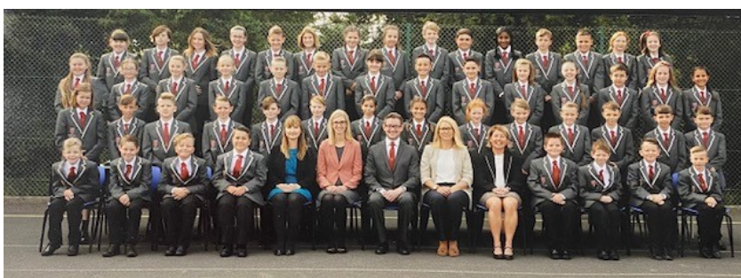
Picture perfect: Our founding year group—the current Year 10s—taken during their first few weeks at The Suthers School back in September 2017 when they were still awaiting completion of their temporary accommodation on the Toot Hill site in Bingham.