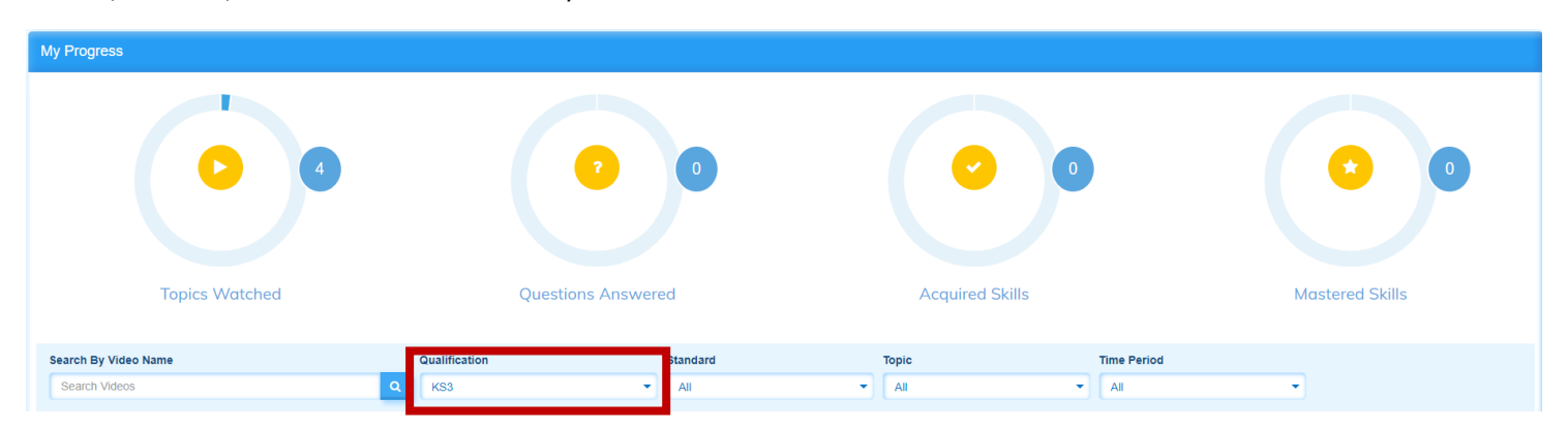
Step 3: Finding a Topic: A list of topics will appear once the qualification has been selected. Search through the topics and find one you would like to practice. There is a video to support your learning or you can start attempting some questions by clicking on the empty box.