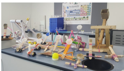
Some examples of the catapults!

Students have been busy uploading house points into e-praise this week, well done to Skylark who are currently in the lead. See below for the student leader board!