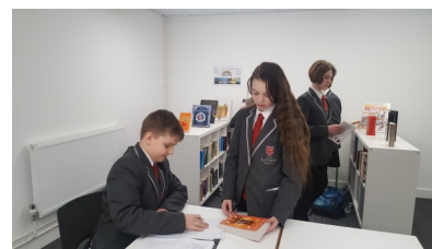
Students using the library at lunch time